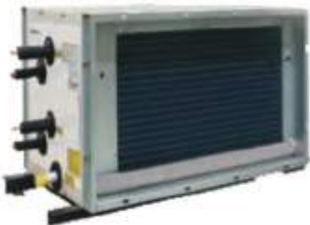
PURIFYING AIR COOLED DUCTED TYPE AC