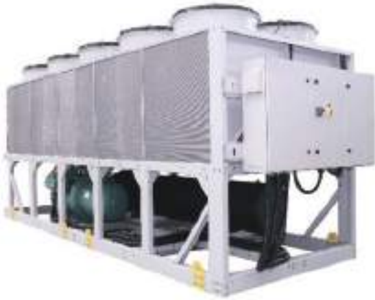
AIR COOLED SCREW CHILLER (COOLING ONLY)