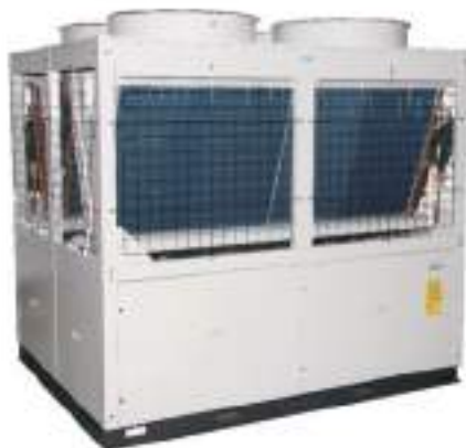
AIR COOLED SCROLL CHILLER