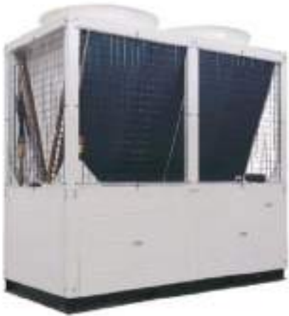
AIR COOLED MODULAR CHILLER (COOLING ONLY/HEAT PUMP)