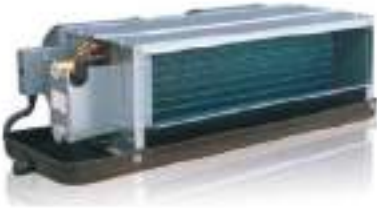
CEILING CONCEALED FCU