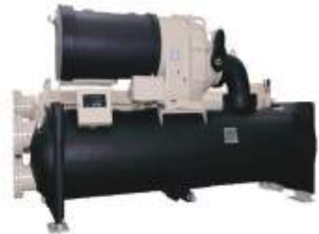
WATER COOLED CENTRIFUGAL CHILLER (COOLING ONLY)