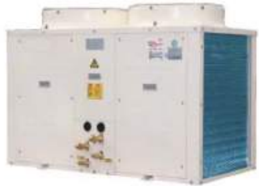
AIR COOLED DUCT AC (HEAT PUMP)