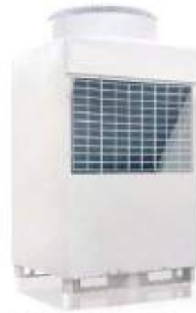
AIR SOURCE HEAT PUMP WATER HEATER