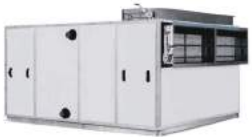
STANDARD AIR HANDLING UNIT (HORIZONTAL TYPE)