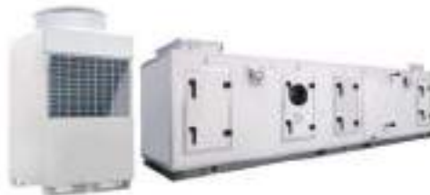
DIGITAL VARIABLE-CAPACITY DX AHU