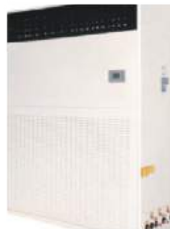
AIR COOLED CABINET TYPE AC