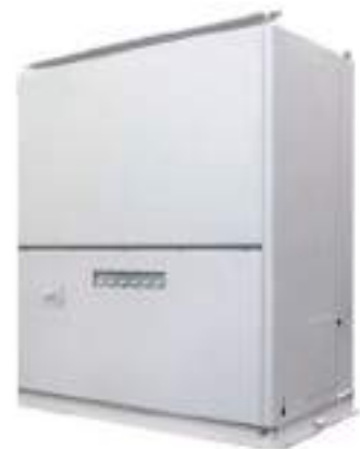
WATER COOLED PACKAGE FLOOR STANDING R410A