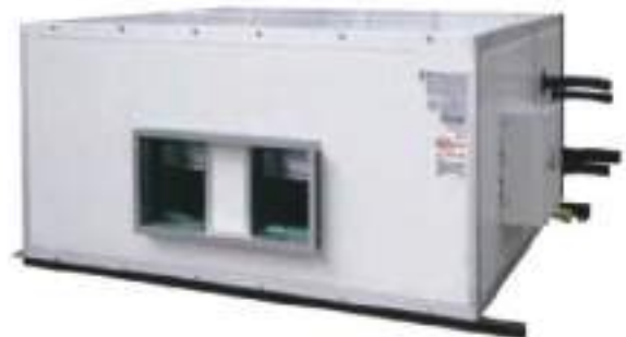
FRESH AIR COOLED DUCTED TYPE AC