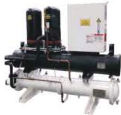
WATER COOLED MODULAR CHILLER (COOLING ONLY)