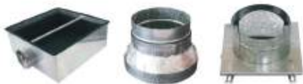
Volume Control Dampers