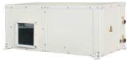
WATER SOURCE HEAT PUMP