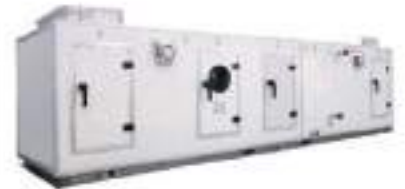
MODULAR AIR HANDLING UNIT