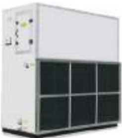
STANDARD AIR HANDLING UNIT (VERTICAL TYPE)