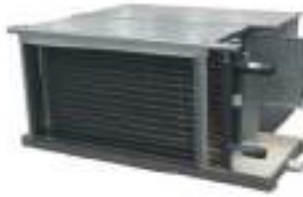
HIGH PRESSURE CEILING CONCEALED FCU