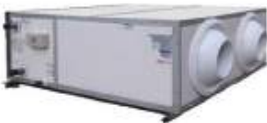
STANDARD AIR HANDLING UNIT (CEILING TYPE)