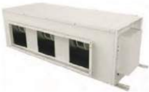
STANDARD AIR COOLED DUCTED TYPE AC