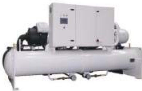
WATER COOLED FLOODED SCREW CHILLER (COOLING ONLY)