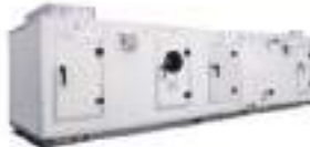
DX MODULAR AIR HANDLING UNIT