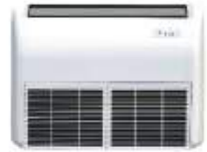
FLOOR STANDING FCU